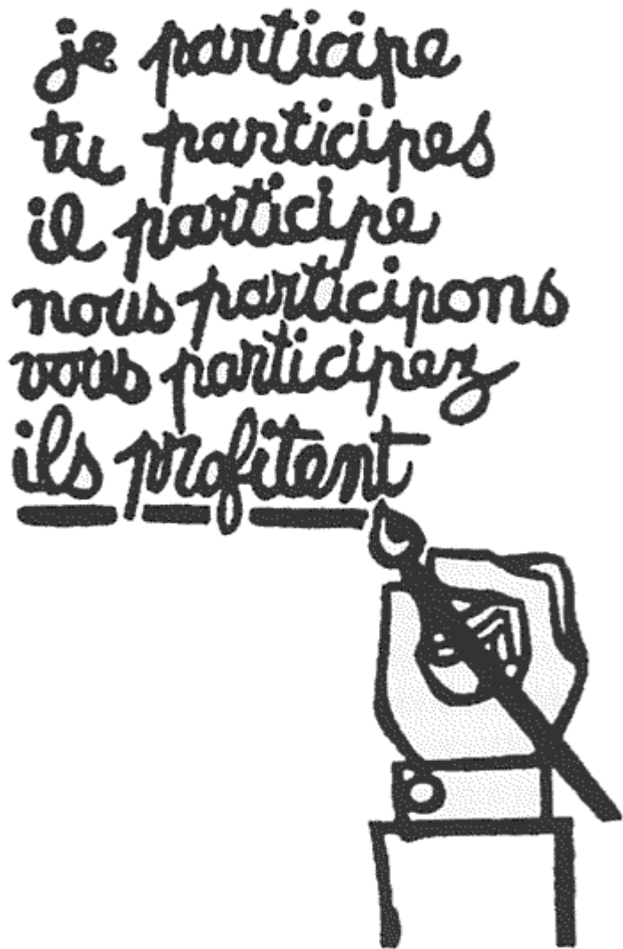
Figure 1. French student poster. In English, "I participate, you participate, he participates, we participate, you participate...they profit."

My answer to the critical what question is simply that citizen participation is a categorical term for citizen power. It is the redistribution of power that enables the have-not citizens, presently excluded from the political and economic processes, to be deliberately included in the future. It is the strategy by which the have-nots join in determining how information is shared, goals and policies are set, tax